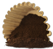
Coffee Grounds & Filters