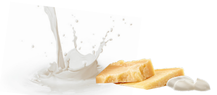
Dairy Products (Milk, cheese, & yogurt)