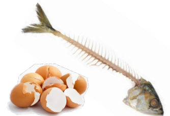
Eggshells & Fish