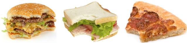
Grains, Oils, & Fats