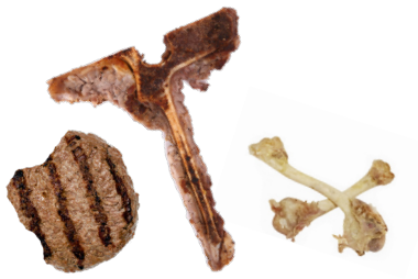
Meats & Bones

TOSS THE ITEMS LISTED BELOW INTO THIS CONTAINER